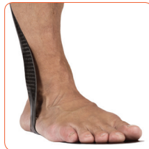
▲ Lateral strut with flexible design. For patients who need more space around the lateral malleolus there is a Wide model available.