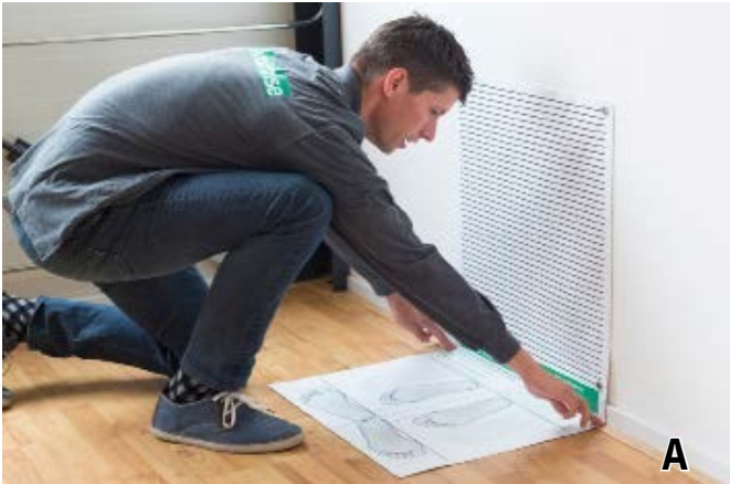
A. Fold the poster on the black line and attach it to the wall.