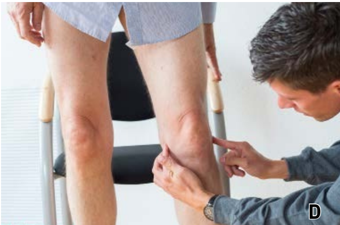
D. Determine the anatomical knee axis