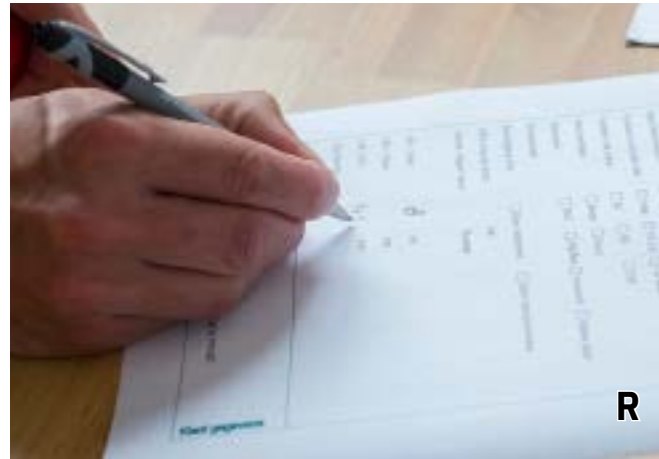
R. Write the measurements on the measurement form.