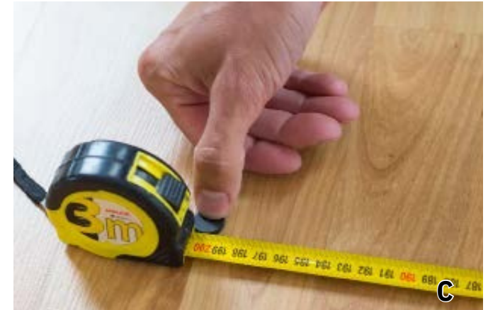
C. Mark the floor at 2m (80 inch) distance from the wall.