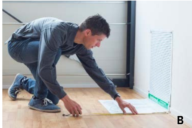
B. Measure 2m distance (80 inch) from the wall.