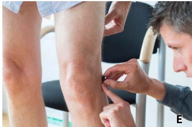
E. Mark knee center at the lateral side of the leg, positioned at the anatomical axis.