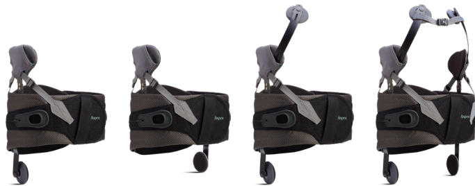
MULTIPLE OPTIONS FROM ONE BRACE

Multiple configuration options give providers the ability to customize a patient's treatment. With this modular design, providers are able to assemble the right brace for each patient.