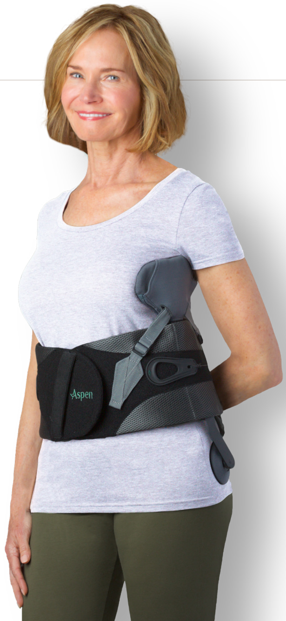
DUAL STRUT CONFIGURATION KIT