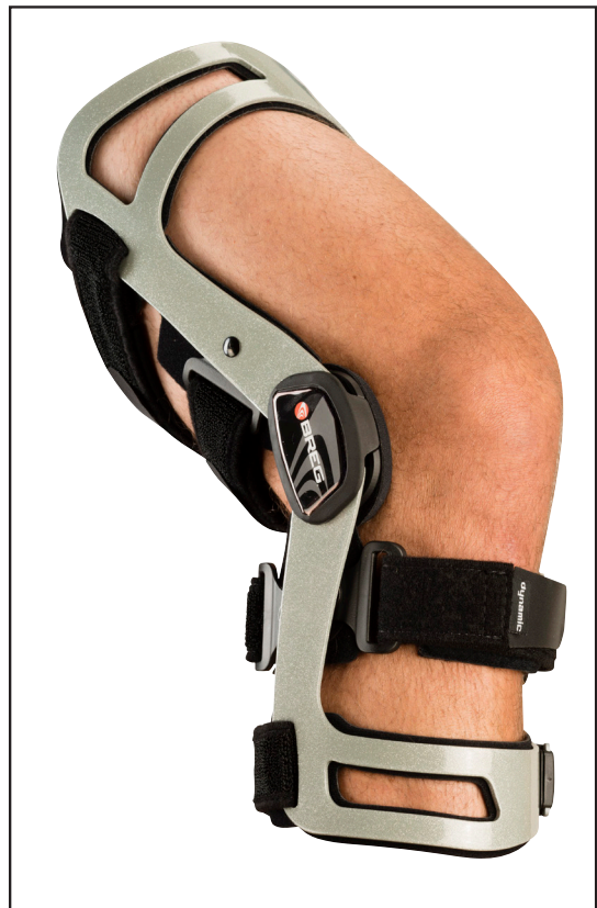
Axiom®-D Elite Brace: With Dynamic Technology

Dynamic knee braces use the power of the muscles that cause tibial translation as a source of power to work against this pathological movement. In the case of dynamic ACL knee braces, some of the quadriceps extensor force is used to provide a progressively increasing force to push the tibia posterior relative to the femur as the knee moves into terminal extension. Force is reduced as the knee flexes back into the ready position. As the knee extends to less than 30° flexion, the force rises more quickly. The resulting force is sufficient to prevent the tibia from subluxing prior to foot strike. 7 As the knee joint is compressed in the proper position, it gains much more stability. 27 This normal tibial position enhances joint position sense and maintains a more normal knee flexion angle. 4 The rapid rise in strap force is often enough to elicit a tonic reflex co-contraction in the hamstrings which further stabilizes the knee and decreases hamstrings latency. 24 An added benefit of using dynamic braces after several days is the muscle re-learning that occurs providing “spontaneous hamstrings coactivation” that is elevated to prevent subluxation even if the brace is removed. 7