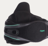
ASPEN VISTA 631 LSO