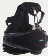
ASPEN VISTA 464 TLSO

The Aspen Vista Lower Spine products are designed so that they may be stepped down to provide the needed support and motion restriction throughout each patient's recovery.