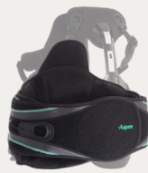
ASPEN VISTA 637 LSO