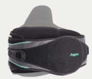
ASPEN VISTA 627 LSO

← FITS WAIST CIRCUMFERENCE RANGING FROM 26-60 IN (66-152 CM) AND UP TO 70 IN (178 CM) WITH ASPEN EXTENSION PANEL →