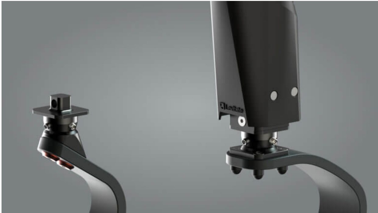
Quick change adapter set on Levitate Socket, Forever II and Blade II