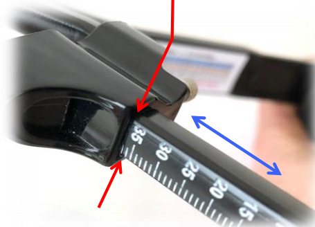
ADJUST LENGTH TO SHOE SIZE. (SEE CHART ABOVE) RELEASE SET SCREW WITH 7/64" HEX KEY INCLUDED.