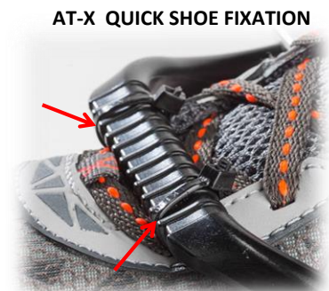
ATTACH TIE-WRAP SOLIDLY IN EYELETS. NEVER ATTACH AROUND THE LACES ! TRIAL WITH ROBUST SNEAKERS, RUNNING SHOES WITH MANY EYELETS AND BULKY SOLE.

***SEE COMPLETE ASSESSMENT PROCEDURE ON THE BACK SIDE***