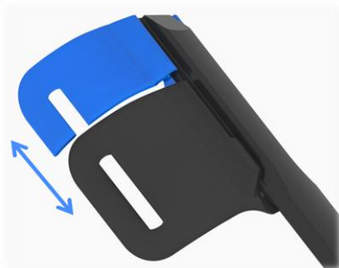
ADJUST CALF SUPPORT ON PATIENT. SLIDE CALF UP <--> DOWN